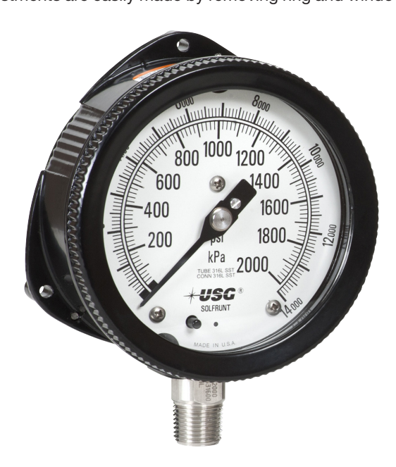
SOLFRUNT Model 1931

Span adjustments can be accomplished from rear of case without disturbing the gauge internals. Pointer adjustments are easily made by removing ring and window.